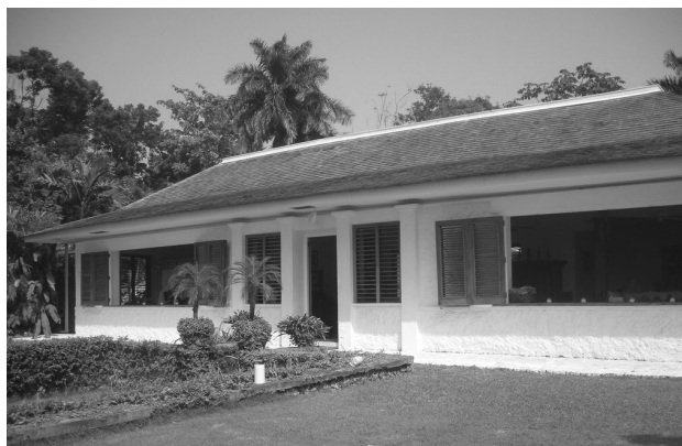
Goldeneye, in Jamaica, where Fleming wrote all the Bond novels

It was while he was in Tokyo that he wrote about his experiences seeing a fortune-teller prefaced with the quote that now graces my collection: "I am not particularly